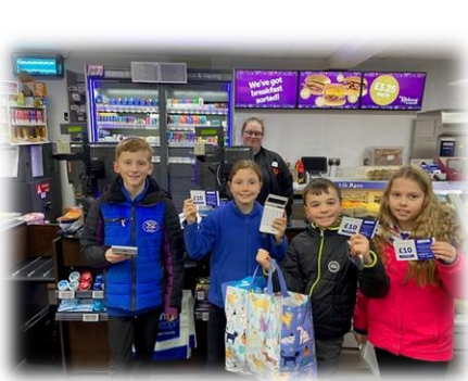
Shopping and dealing with the public

Look at the skills we learn running our Fabulous Fairtrade Feasts tuckshop.