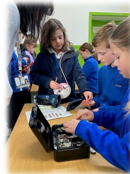
Selling - Costs and change

Applying knowledge of numeracy to working how much individual items cost