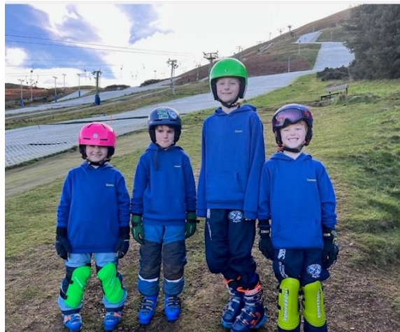
Meet BD's new ski team

Article 15 - The right to set up or join a group Global Goal 3 - Good health and wellbeing